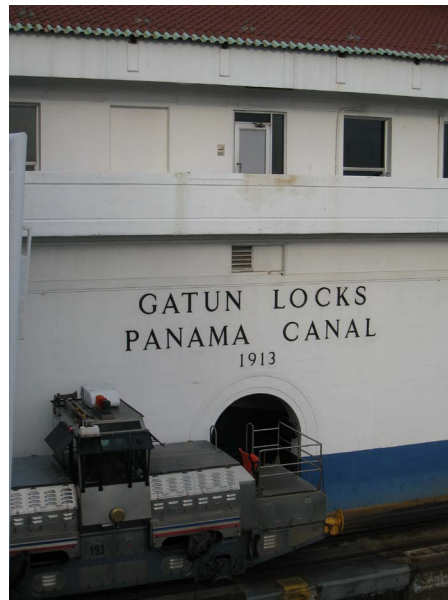
Figure 3. Gatun Locks sign dated 1913 at the Panama Canal.