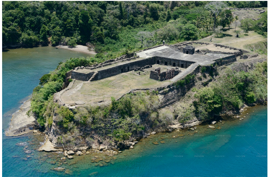
Figure 30. Peninsula with a former military structure on Fort Sherman.

stakes dipped in pesticides and other chemicals including lead arsenate, sodium arsenite and DDT were conducted by the USDA, Forest Service on Barro Colorado Island where the Smithsonian headquarter buildings are located [7]. In 1963 the Curundu Jungle Test site at Fort Clayton on the Pacific side was used to determine which pesticide and chemically treated stakes would not be eaten by the termites. The commercially available herbicide, 2,4-D was used in Lake Gatun since 1948, which was the feeder lake water source for the Panama Canal.