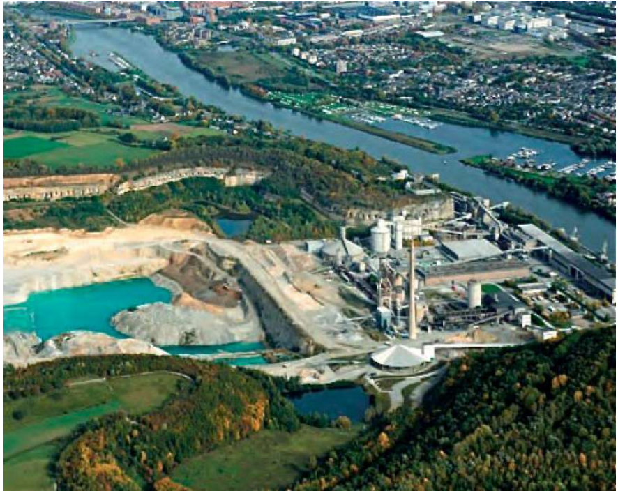
Figure 23. Quarrying and mineral mining along the Panama Canal.