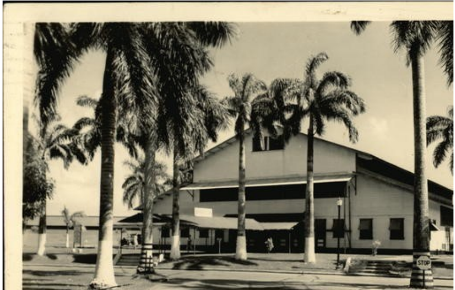
Figure 27. Service center at Fort Davis near Colon, Panama.