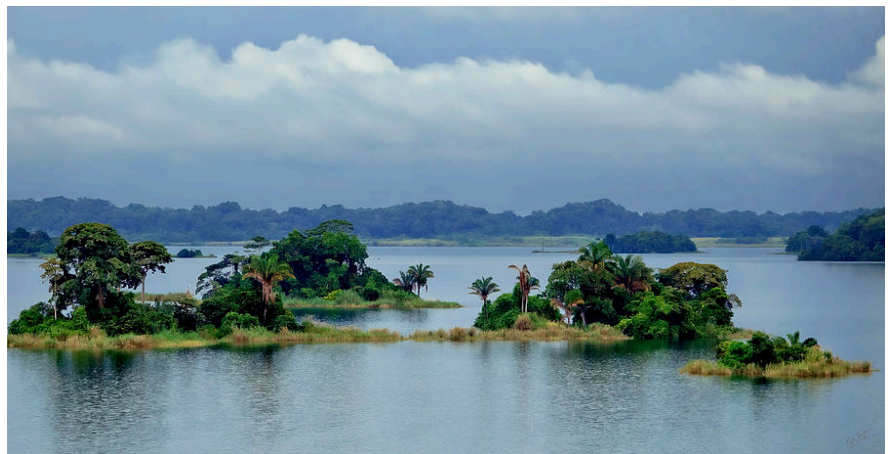
Figure 20. Islands in Lake Gatun which were created in 1913 as a result of the Gatun dam.

The climatic conditions on the Pacific side of Panama differ from the Atlantic region. On the Atlantic side, the Tabasara Mountains face the rain-bearing trade winds and receive twice the average rainfall as the Pacific side. The Caribbean coast receives 150 to 350 cm per year and the Pacific coast receives 110 to 230 cm. It rains throughout the year on the Caribbean side while the Pacific region has a rainy season from May to December and a dry season from January to April. As a result of rainfall distribution patterns, the Caribbean slopes have a tropical rainforest and savannas (tropical grasslands) are common between the Caribbean shoreline line and the Tabasara Mountains. The mean temperature of the coldest months seldom drops below 26 degrees C on either coast due to Panama's tropical location. The Panama mountains create three climate zones [3]. A low, hot zone area has elevations below 700 m which includes 90% of the country; a temperate zone with elevations between 700 and 1500 m; and a tiny