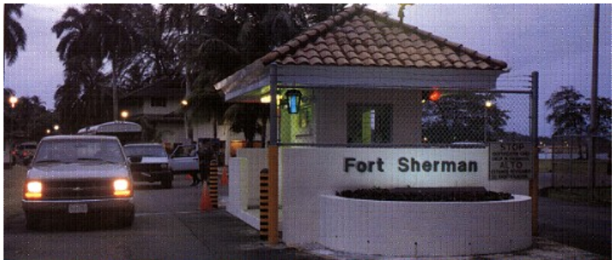
Figure 28. Fort Sherman sign and location of the United States military's Jungle School for many decades.