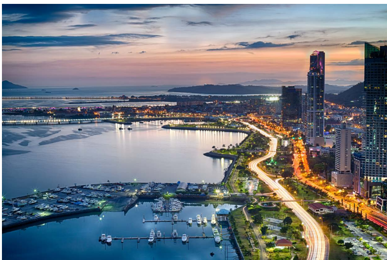
Figure 17. Panama City shoreline along the Pacific Ocean at night.