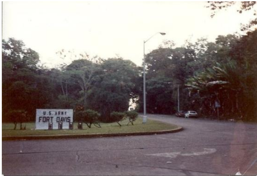
Figure 25. U.S. Army Fort Davis sign. The base was located on the Atlantic side of the Panama Canal Zone.

The U.S. Army technical manual [9] and the U.S. Army Medical Department Center and School subcourse [10] for groundskeepers were used to provide guidance on how to eradicate specific weeds, such as kudzu, and insects on the military base grounds (Figures 25-30). The military properties, housing units, and connecting roads were sprayed daily using truck-mounted sprayers apparently filled with DDT. In the 1940s and 1950s termite stake studies [7], with