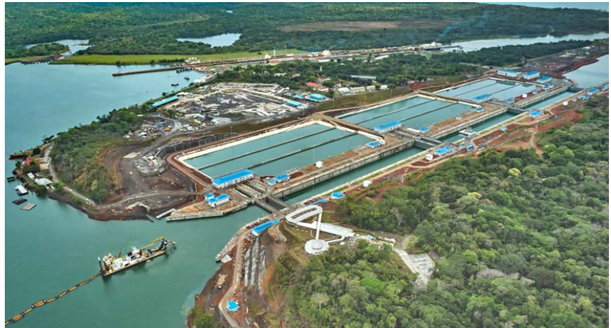
Figure 6. Locks on the southern entrance to the Panama Canal.