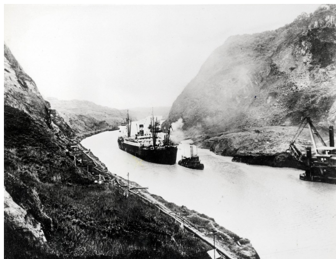
Figure 11. Tug boat pulling a ship through the Panama Canal in the 1910s.