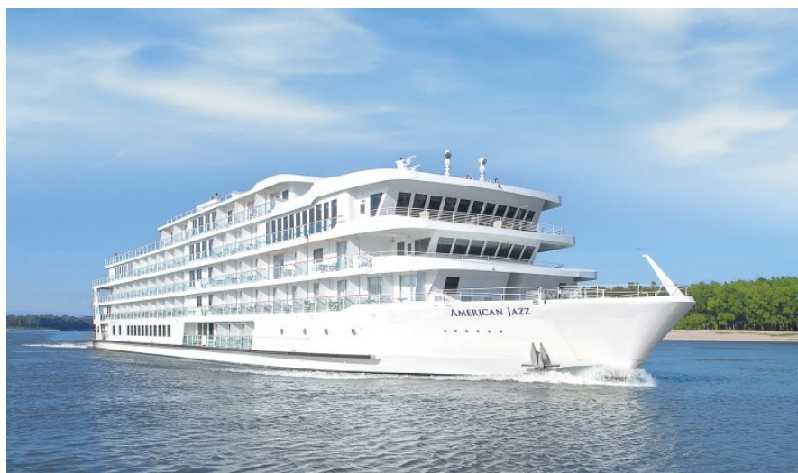
Figure 22. Cruise ship going through the Panama Canal.

The service sector generates 75% of Panama's gross domestic product (GDP). Services are related to canal traffic (Figure 22), public administration, mineral extraction (Figure 23) offshore banking and other services. Fishing and agriculture accounted for less than 10% of the GDP prior to 1990s [1]. Prior to the 1990s, U.S. military forces stationed in Panama supported 5% of GDP. After U.S. troop withdrawal, the Panamanian government lost millions of dollars. The Panamanian government has re-developed (Figure 24) the previously U.S. controlled properties in the Panama Canal Zone and prime real estate in Panama City. The government repaired the road and rail system and has promoted ecotourism. China, Latin America, Middle East and the U.S. have all invested in