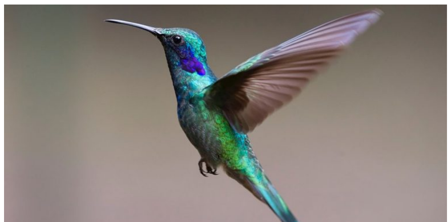
Figure 2. Humming bird in flight in the Panama Canal Zone.