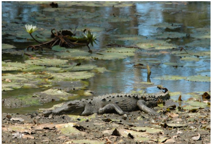
Figure 21. American crocodile in Lake Gatun.

When the Spaniards came in the 16 th century the land was occupied by Kuna, Choco, and Guaymi Native American groups. The population soon included mestizos, a mix of people with Indian and Spanish ancestry. With the construction of the Colon-Panama City railroad, new ethnic groups from all over the world arrived to work on the railroad as laborers. The Native Indians often lived in rainforests. Most of the Indians, including the Choco, engaged in subsistence agriculture, hunting and fishing, while the Kuna were sailors, traders and mechanics and the Guaymi worked on banana plantations in western Panama. Today the Mestizos, who are intermarried with people of West India and African ancestry are the largest Native American group in Panama. They predominately live west of the canal in the savannas and in the central provinces of Colon and Panama.