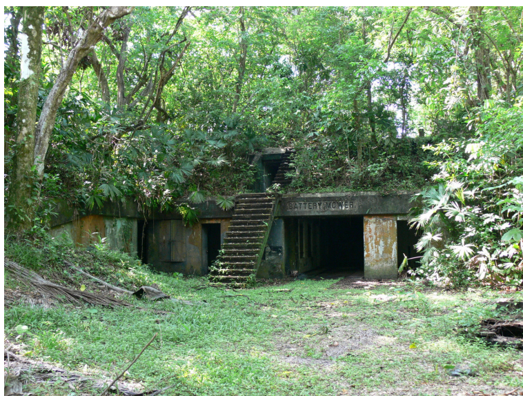
Figure 29. A former battery at Fort Sherman. The jungle is reclaiming the site.