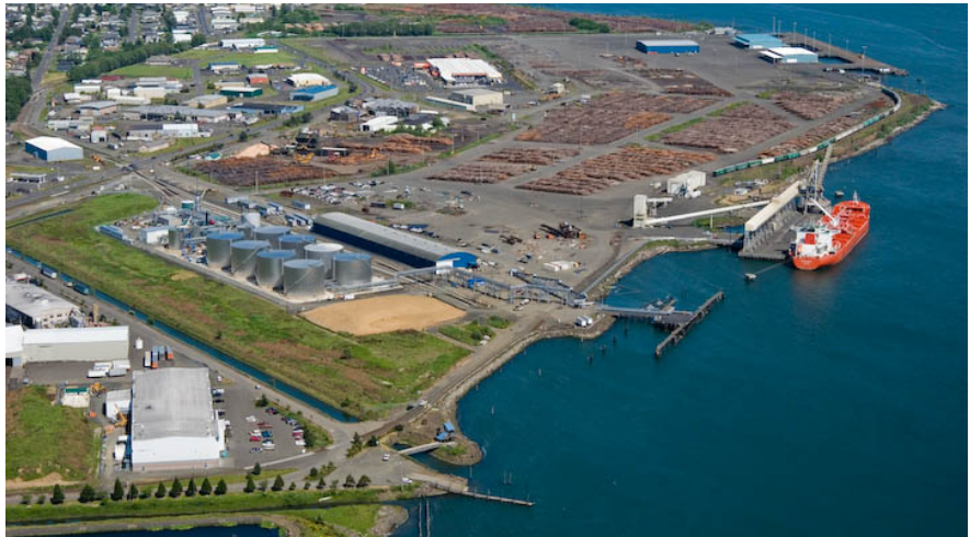
Figure 9. Ship docked at a Panama Canal harbor.