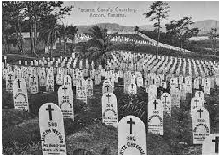
Figure 31. A cemetery used to bury the dead who died of malaria and yellow fever during the 1910s.