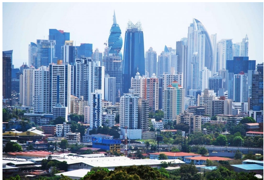
Figure 13. The modern Panama City skyline.