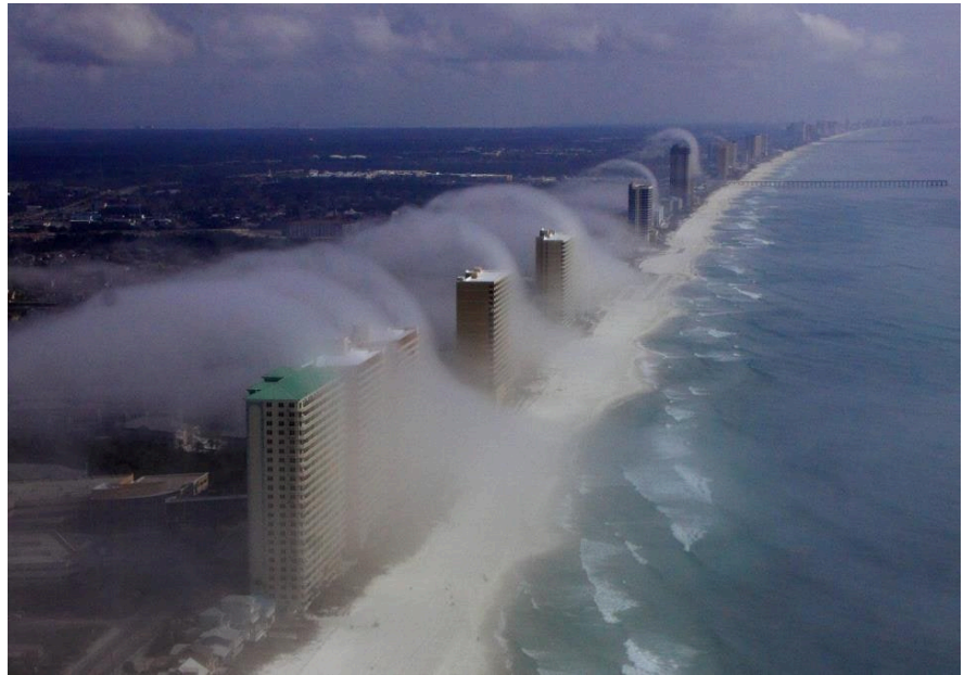
Figure 18. Mist created by temperature difference between the upland and the Pacific Ocean near Panama City.

includes the Cordillera de San Blas Range in the east and the Tabasara Mountain Range in the west [3]. These ranges are separated in the center of Panama by a saddle of lower elevation land. The country's highest peak is Baru, an inactive volcano which has an elevation of 3475 m. The Pacific coast has numerous headlands and bays in the Gulf of Panama. The large Chiriqui Lagoon is where Columbus made his last attempt to find a passage to the East Indies. The continental shelf is much more extensive on the Atlantic side. Most of the 1600 islands are on the Pacific coast side.