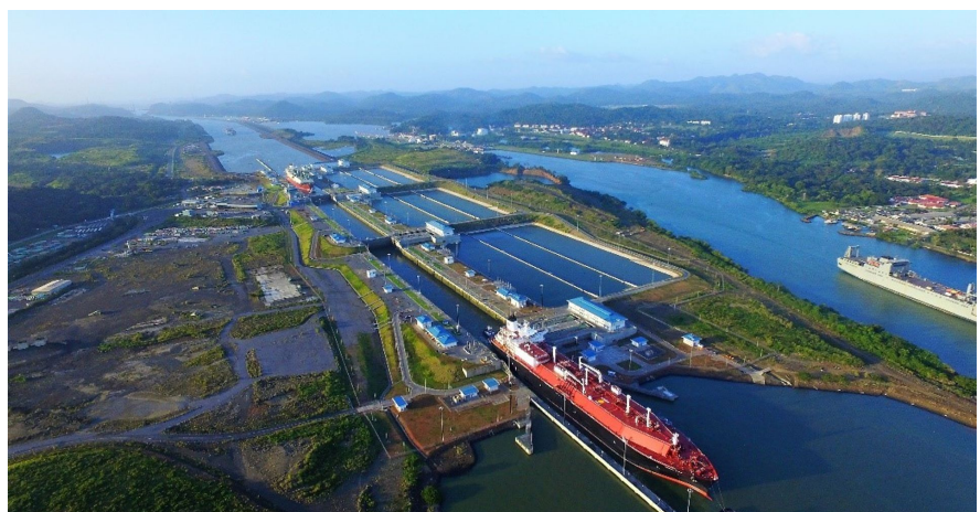
Figure 8. Ships going through a lock near the southern entrance of the Panama Canal.