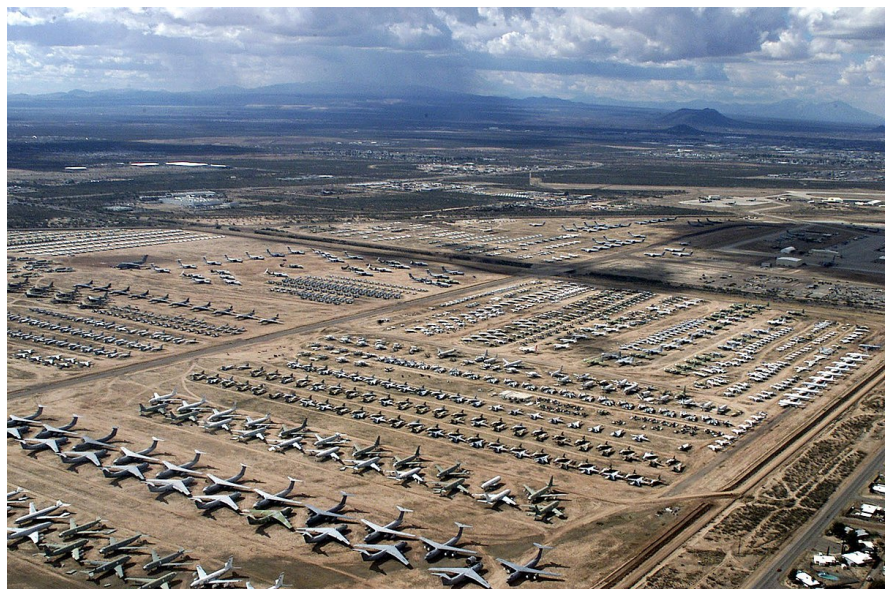
Figure 34. Perimeter fence at Davis-Monthan Air Force base in Arizona where the U.S. military planes go to die.