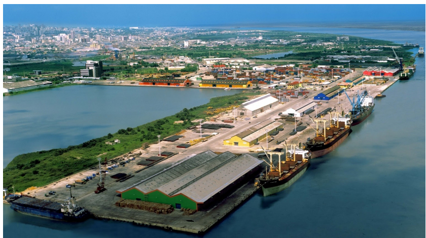
Figure 5. Four ships at a port near Panama City along the Panama Canal.