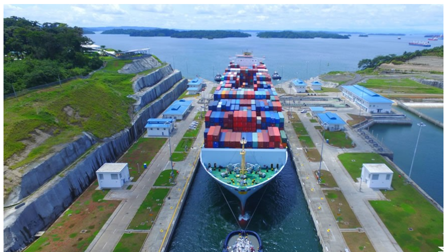
Figure 7. Loaded ship coming through a lock on the southern entrance to the Panama Canal.