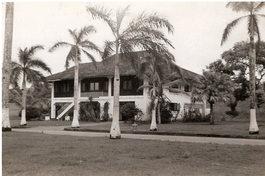
Figure 26. Housing at Fort Davis near Colon, Panama. The residences and fort were sprayed nightly to control the insects. DDT was the most commonly used pesticide.