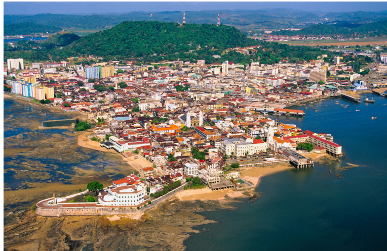
Figure 15. Panama City at the mouth of Panama Canal at Pacific Ocean.