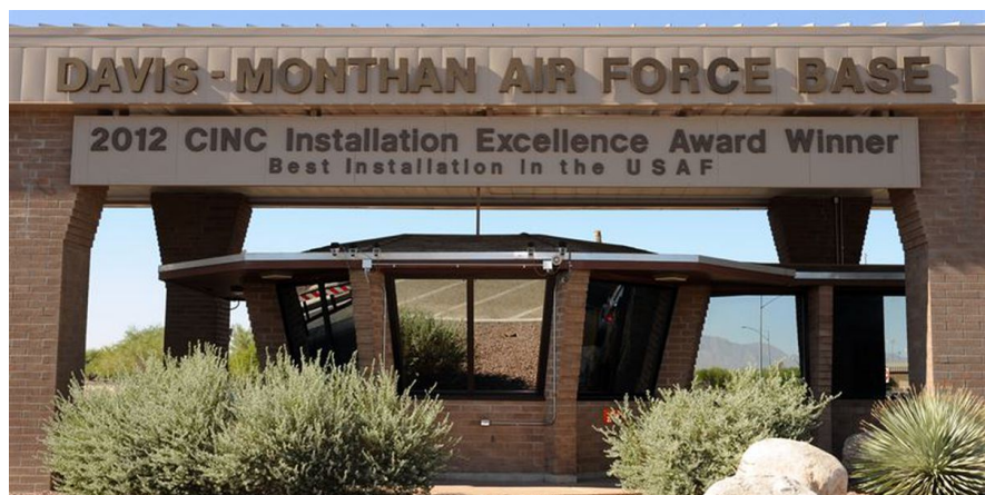
Figure 33. Davis-Monthan Air Force Base Headquarters in Arizona. The final resting place for U.S. military planes.

Was Agent Blue destroyed in Kelly Air Force base burn pits? If so the smoke coming from the burn pits would have become an environmental problem since the particulate and ash would have contained toxic As contaminants and aerosols. The military base personnel could have been exposed to and inhaled arsenic laden smoke. Was it buried in the soil at Kelly Air Force base? If so, the water soluble As would eventually leak from the barrels in the last 50 years and into the groundwater. If so, the military base personnel could have been exposed to arsenic and some Kelly Air Force Base Vietnam Era Veterans [12] have already filed VA claims for benefits as a result of exposure to either TCDD or arsenic. The fourth option would have been to transport the Agent Blue to Davis-Monthan Air Force Base in Tucson, Arizona for weed control around the aircraft and perimeter fence (Figure 33 and Figure 34). This would have been in