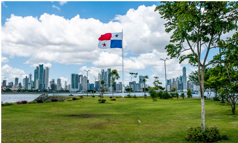
Figure 16. Panamanian flag and parkland across the canal from Panama City which is in background.