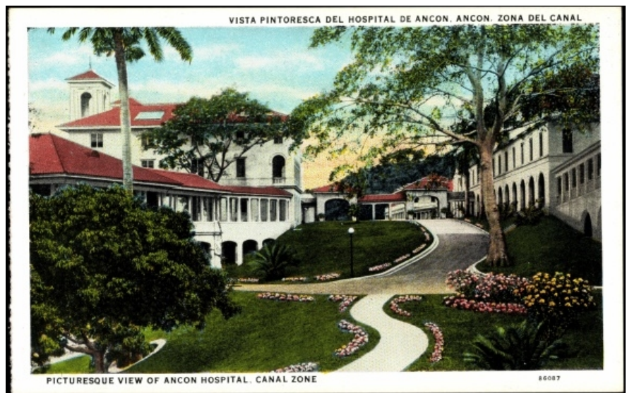
Figure 32. The Ancon hospital located in the Panama Canal Zone where the malaria and yellow fever.

the U.S. Army Medical Officer to control of yellow fever which consisted of extensive drainage to reduce breeding of mosquitoes and putting screens on houses. The Isthmus of Panama was an ideal environment for mosquitoes [11] [12]. The same concept was applied a few years later in Panama [8]. In June 30, 1904 the Sanitary Department was created and headed by Colonel Gorgas. He applied a military style campaign to eradicate mosquitoes, which, while costly, greatly reduced the breeding of mosquitoes and yellow fever and malaria transmission [8].