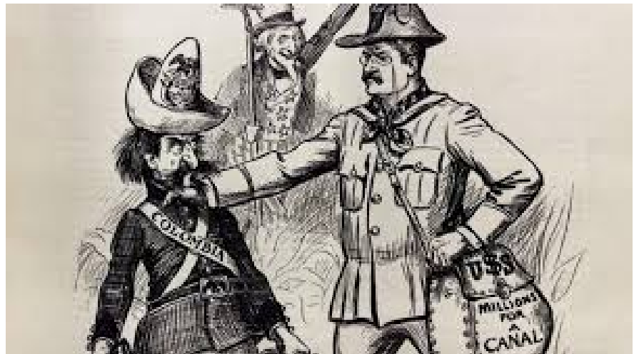
Figure 12. President Roosevelt enforcing his will on the leader of Colombia. The agreement was actually with Colombia and not Panama.