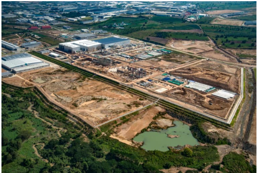
Figure 24. Re-development of former military lands along the Panama Canal.

Panama which has boosted economic growth. Starting in 2020 COVID-19 has disrupted re-development of former U.S military bases and increased the rural and urban crime rate in Panama.