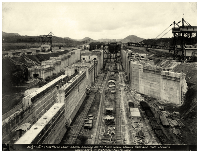
Figure 10. Construction in the early 1910s of a lock on the Panama Canal.