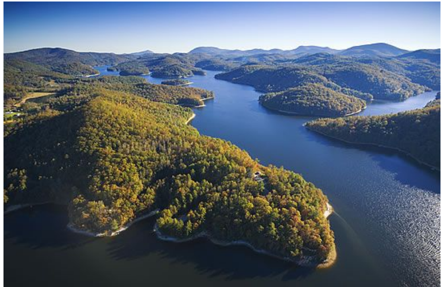
Figure 19. Forested islands and peninsula uplands in Lake Gatun.