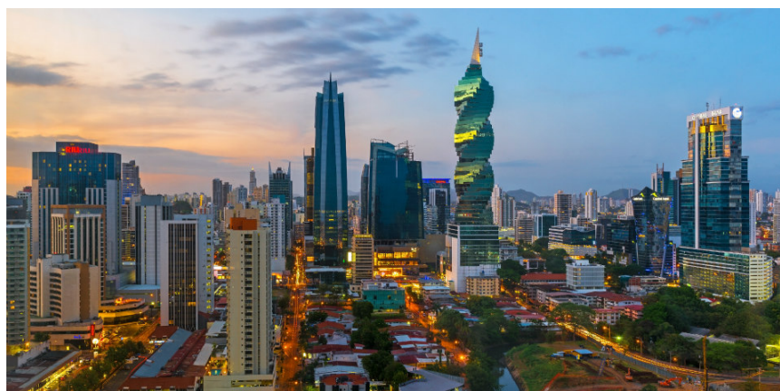
Figure 14. Panama City with modern twisted skyscraper.