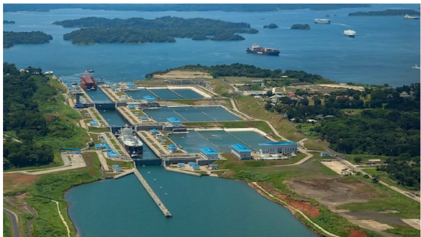
Figure 4. Locks at the southern (Pacific Ocean) entrance of Panama Canal Zone.